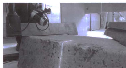
Photo 1. Scanning the surface of reinforced concrete sleeper

Using the developed software according to the developed algorithms for automatic recognition and measurement of bitmap images it is determined the parameters of scanned laser trail on the surface of sleeper that are transferred to the computer memory and displayed on the monitor. After measuring the cross-section of the impact mark surface of the sleeper in the given number of steps of longitudinal movement of measuring system, the results of individual measurements are connected and the mathematical model of the impact mark surface is being formed (Figure).