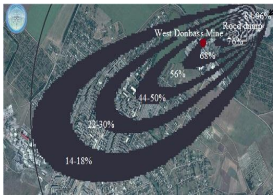
Fig. 1. Percentage distribution of carbon monoxide concentration in the contaminated zone

The developed codes were used to solve two problems. The first problem is the calculation of the atmospheric air pollution zone with carbon monoxide using the proposed numerical model. The source of pollution are the dumps of the West-Donbas mine, the characteristic dimensions of the occupied territory are 860 m by 415 m according to the map. With the possible spontaneous combustion of these dumps, more than 10 tons/day of carbon monoxide can enter the atmosphere. The West-Donbas mine is a coal mining enterprise in the town of Ternivka, Dnipropetrovsk region (Ukraine), commissioned since 1979, is included in the PAO «Ternove» mine management of «DTEK Pavlohraduvhillya» (DTEK) from 2013, the largest mine in the Western Donbass. The calculation was carried out with the following parameters: the dimensions of the computed area were 4 km per 2 km, the wind velocity was U = 6 m/s with the south-west direction (Fig. 1), C_{\max} = 18.381 mg/m 3 with steady flow regime.