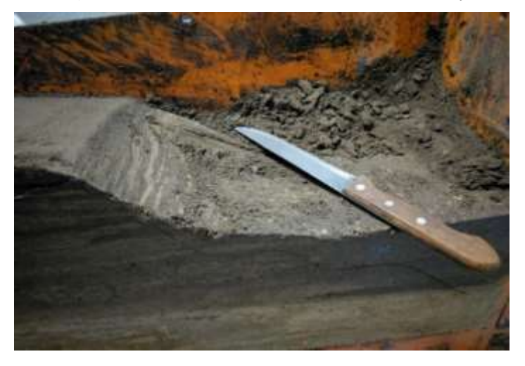
Figure 3 Slicing the soaked soil according to the profile of the slope