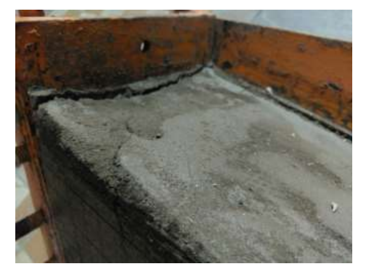
Figure 5. Creation of cracks and separation surfaces, drainage of soil after centrifuge rotation

- photofixation of deformed parts of the model, soil damage - cracks, shrinkage and deformations that arose as a result of rotation on the centrifuge;