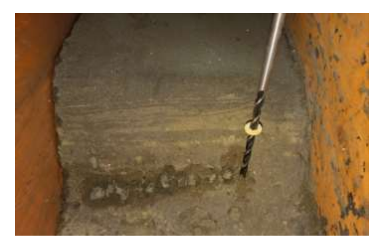
Figure 6 Positioning of ground cement piles in the body of the slope

Application of Centrifugal Modeling for the Study of Landscape Structure Stability