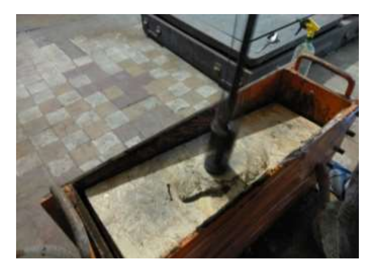
Figure 2 Thickness of the soil to a certain density

Application of Centrifugal Modeling for the Study of Landscape Structure Stability