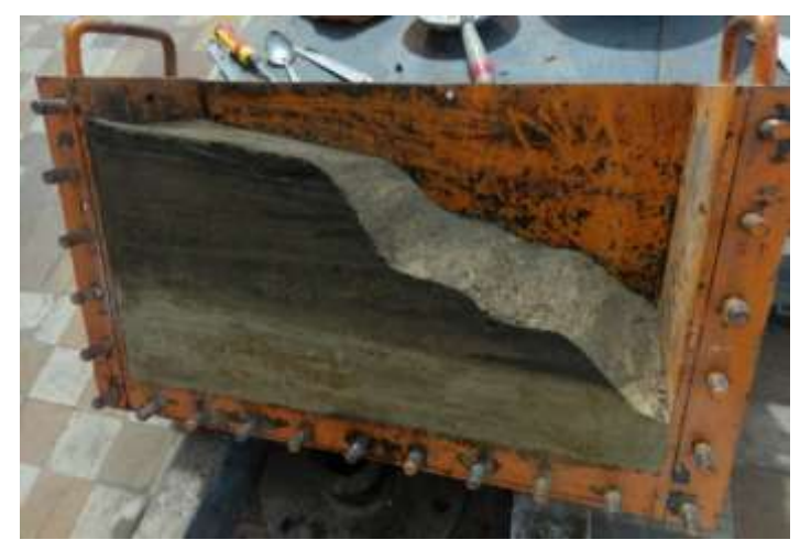
Figure 4 Slope model at scale 1: 100 after cutting of unnecessary soil

– placement of a grid in the size of 2 \times 2 cm on the surface of the soil on the side of the model using a ruler and a pencil;