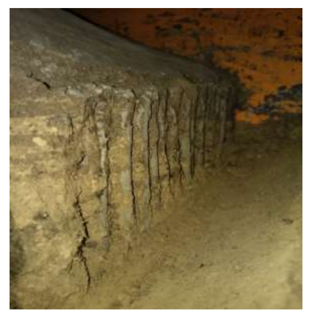
Figure 7 Ground cement piles in the body of the slope after excavation of the soil part