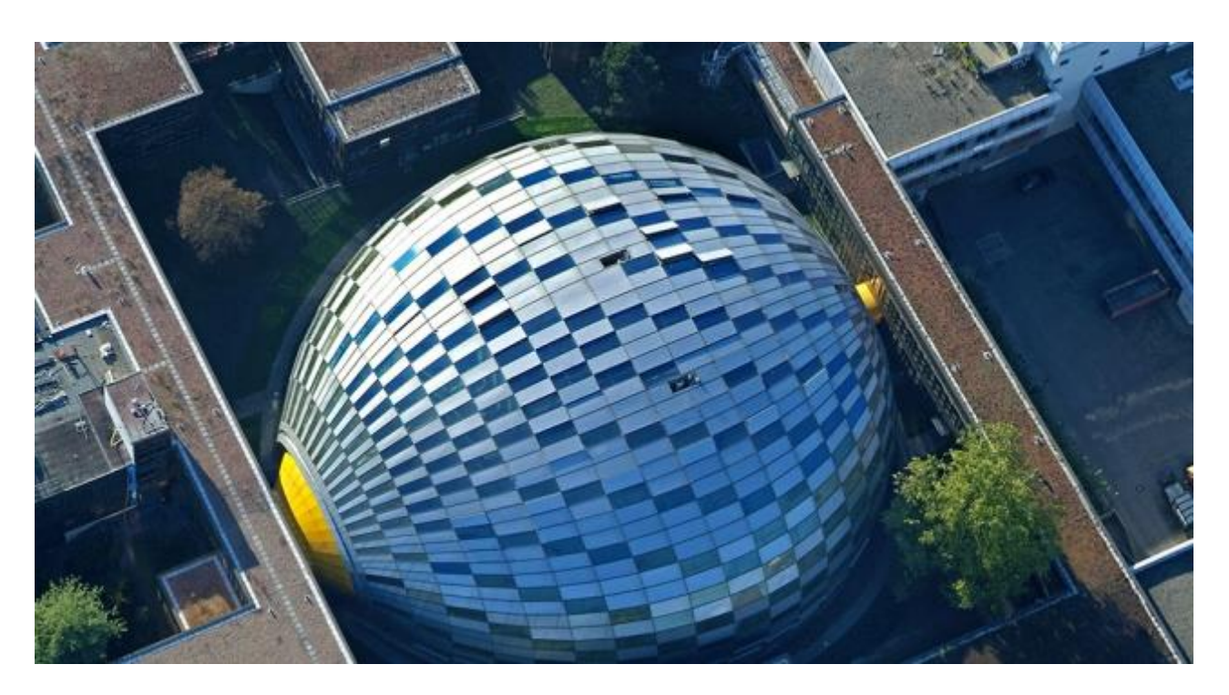
Figure 1. Free university of Berlin, the Philological Library