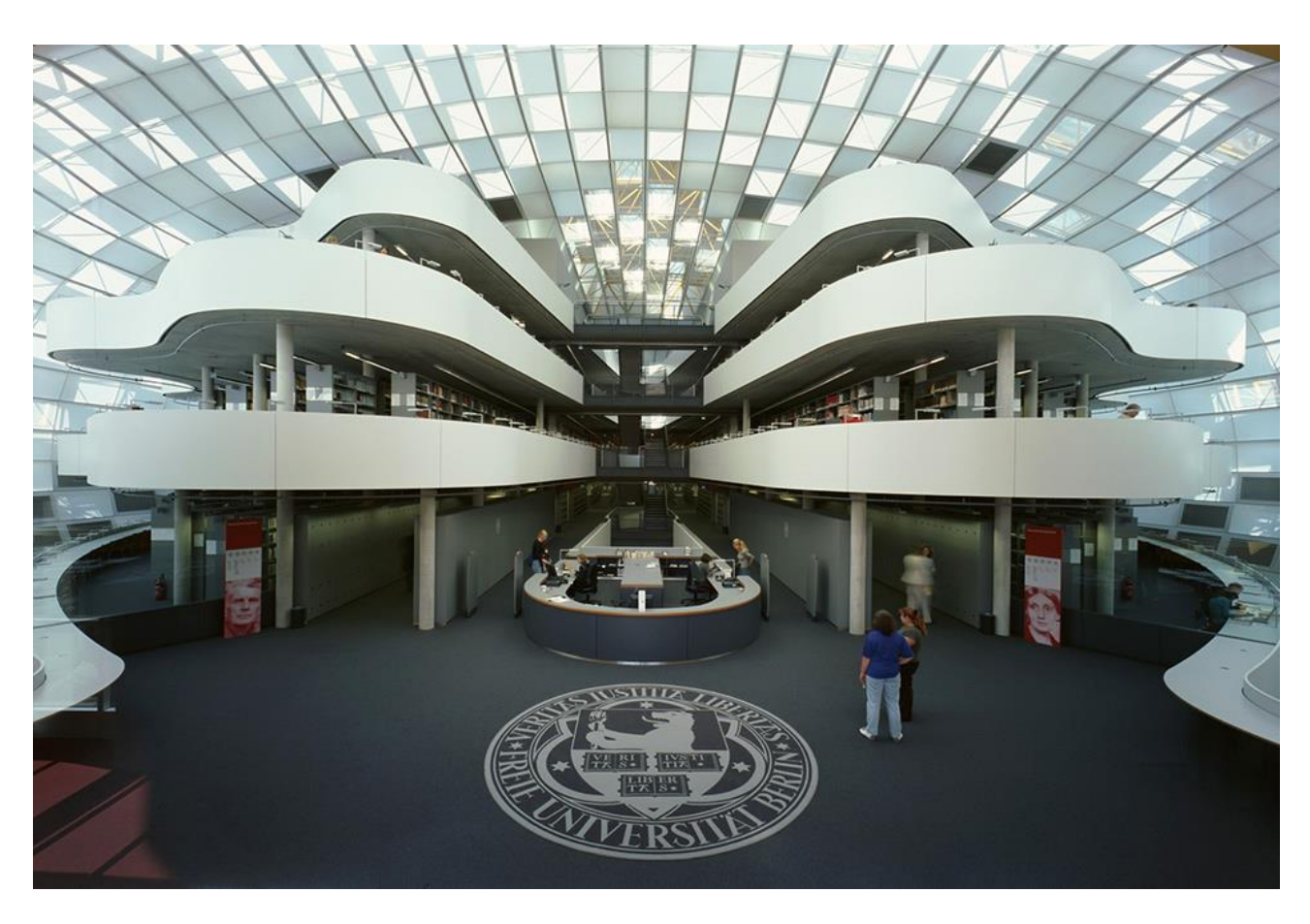
Figure 2. The entrance hall of the Philological Library