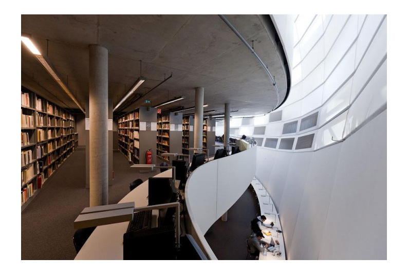
Figure 3. Curved lines and the dynamic structure

librarians, some of whom are university students, who work mainly in the evening and on weekends. This is how the question of library opening hours is resolved (Boyarinova, 2018). The Free University Philological Library is a reference-type library, where visitors work with indoor sources, while the subscription is for night work only (Hallmann, 2013). On the university's website you can find an interactive map of the Philological Library, with which you can navigate freely in the library room and find the necessary sections of literature on the shelves.