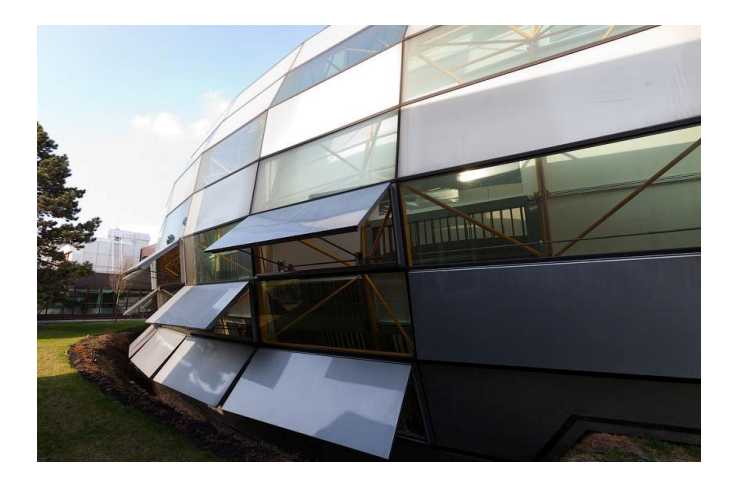
Figure 5. Natural ventilation

and 1979, whose design was developed by German architects together with Jean Prouvet. The originality of the new building designed by Norman Foster lies primarily in the cellular structure of the shell made of steel, glass and aluminium. The second fibreglass shell covers the core of the building itself and is shaped like a dome. Under the dome is a curved shape cladding that follows the shape of the brain. Thanks to this shape, the library is popularly called the 'Berlin Brain' (Kords & Zavhorodnia, 2013). The characteristic feature of the library is the combination of a monolithic concrete structure and a permeable coating. They define the ecological concept of the building, according to which natural light and ventilation are essential elements. Bookshelves are centrally located on all four levels and framed by desks. The individual levels are curved, so that a dynamic structure with spacious mezzanine is created in the interior. (Fig. 3). The facade is both a heat conductor and a buffer - individual panels can be opened depending on the weather. The massive internal concrete structure acts as a heat accumulator and is additionally cooled or heated by water pipes. For most of the year, the library is fully ventilated through the outer shell and daylight is also natural (Philologische Bibliothek der Freien Universität Berlin, (n. d.)). Thus, 60% of the ventilation used during the year is natural ventilation, i.e. free of charge. (Fig. 5, 6).